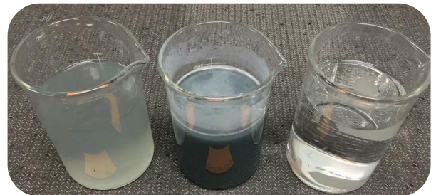
Left to right: Feed, concentrate and permeate